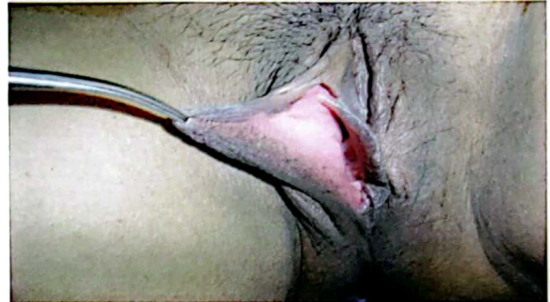
Fig 1: Prominent labia minora

It is usually performed by freshening the edges and approximation of the hymenal membrane with absorbable interrupted suture to narrow the vaginal orifice 3 .