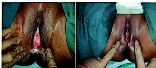
Fig 3: Before and after Perineoplasty

In our studies, majority of the patients ranged from 31-40 years (Table 1). This age group is sexually active and more aware about their body changes. This reminds us that we are living in a global village and an easy communication system have made our patients think like some other parts of the world.