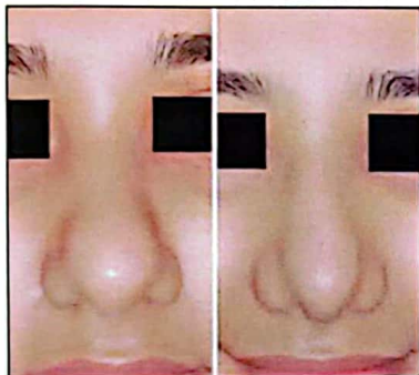
Figure 3: Before and after Microdiced Cartilage Fascia Augmentation Rhinoplasty - front view.