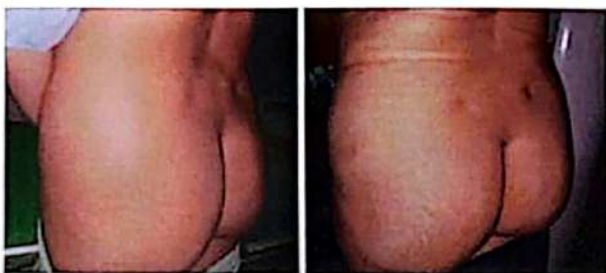
Figure 5: before &amp; after lipoinjection for hip augmentation