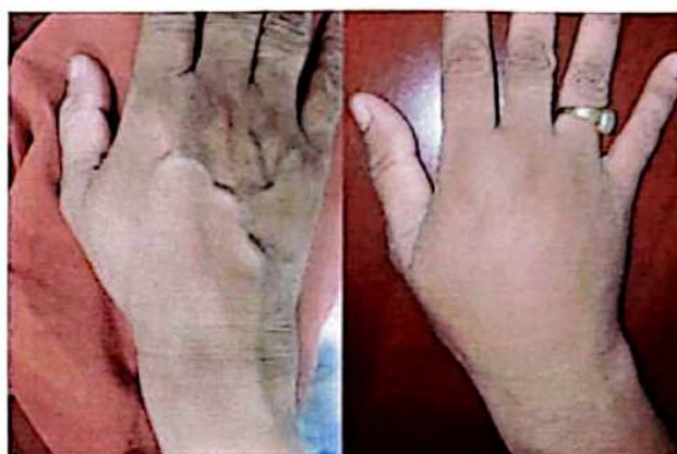
Figure 2: Before & after lipoinjection for hand rejuvenation