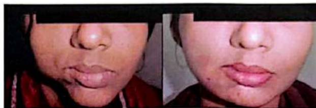
Figure 1: Before & after lipoinjection for a patient with Parry Romb syndrome

Surgeon satisfaction and patient satisfaction assessment was performed by clinical and overall appearance. It was done by clinical examination and comparing the preoperative and six-month postoperative photographs.