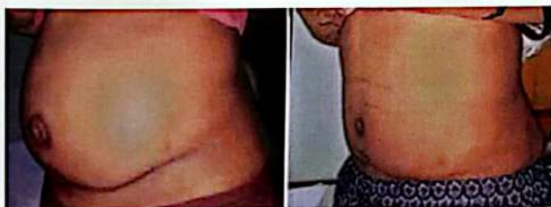
Figure 11: Before and after Revision Lipoabdominoplasty with Umbilical Hernia repair