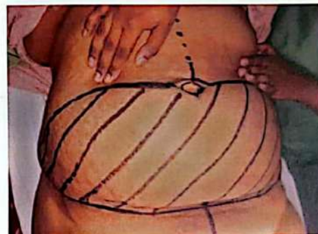
Figure 2: Preoperative Marking