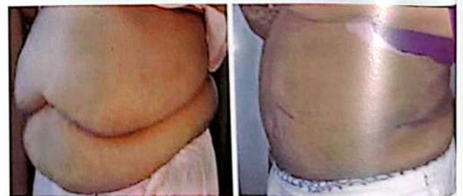
Figure 8: Before and after Lipoabdominoplasty