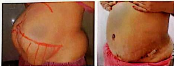
Figure 9: Before and after Lipoabdominoplasty and Ventral Hernia Repair