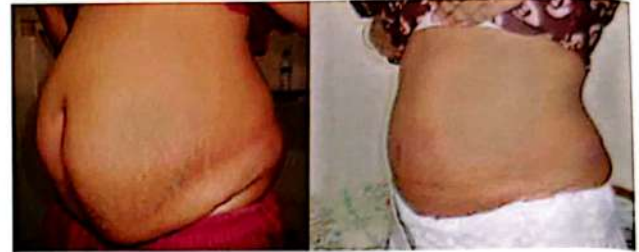
Figure 5: Before and after Lipoabdominoplasty

Only four patients amongst drainless abdominoplasty had seroma formation and one patient in whom drain was used had a minor wound dehiscence. None of the patients had flap necrosis or infection. Early mobilization was easier in patients without drain.