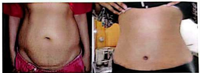
Figure 6: Before and after Lipoabdominoplasty