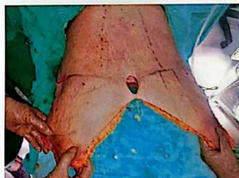
Figure 3: Excess skin flap pulled down after detaching bilicus