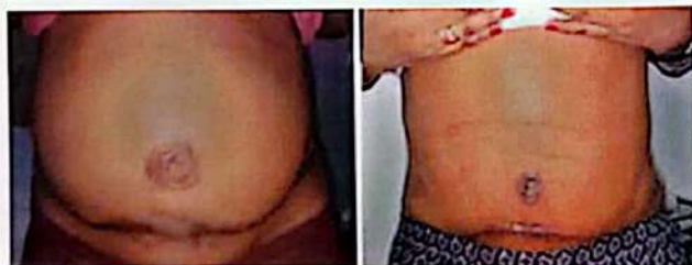
Figure 12: Same patient as in figure 11, front view