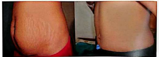
Figure 7: Before and after Lipoabdominoplasty; significant reduction of stretch marks is noted