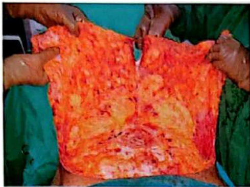
Figure 4: Extent of supra umbilical dissection