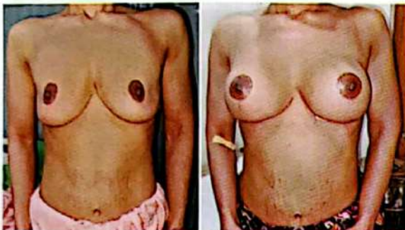
Fig 3: before and after images following subfascial breast augmentation surgery after 6 months.