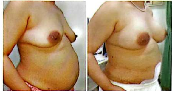
Fig 5: Same patient as in Figure 4 in right oblique view.

any complications during the post-operative period and during follow-up. The level of satisfaction was assessed six months after the procedure. During six months after surgery, breast shape continues to change and edema might cause potential volume distortion and asymmetry 18 .