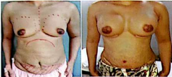
Fig 2: before and after one month of breast augmentation

complication was observed during the postoperative period and follow-up at the one month, sixth month, 1st year, 2nd year and at 3rd year follow-up after surgery were recorded. No capsular; contracture, or post-operative wound infections were seen and no animation deformity was reported during the study period.